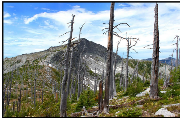
Legacy of the Sundance Fire, 1967

On September 1, 1967, the Sundance Fire stormed across the Selkirk Divide and into the Pack River drainage. The fire consumed a swath of forest 8 miles wide and 16 miles long in just nine hours. It was one of the hottest, fastest, and most destructive fires in the history of U.S. firefighting. In the end, the Sundance Fire charred 55,910 acres.