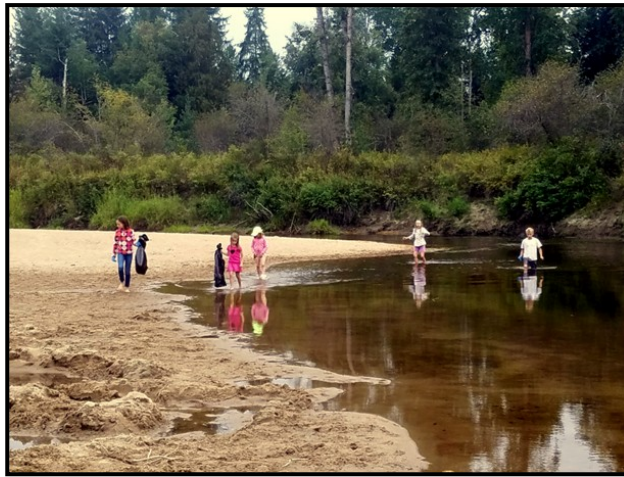
Pack River clean-up day with the Pack River Pioneers

I recruited the Pack River Pioneers, a local 4-H group to help with the pick-up. On September 17th, fifteen eager volunteers showed up with latex gloves and garbage bags to see what they could accomplish. To our surprise, we were able to fill over ten 30-gallon bags with random refuse. It felt like a great accomplishment!