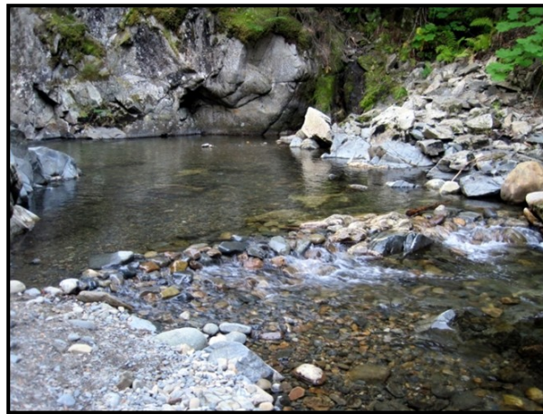
Rock dam built below Grouse Creek Falls

In an effort to escape the intense heat of the long hot summer days, people headed for their favorite swimming holes in droves. With water levels in creeks at record lows this year, campers and recreationists began to build or enhance their own cool swimming pools by building rock dams.