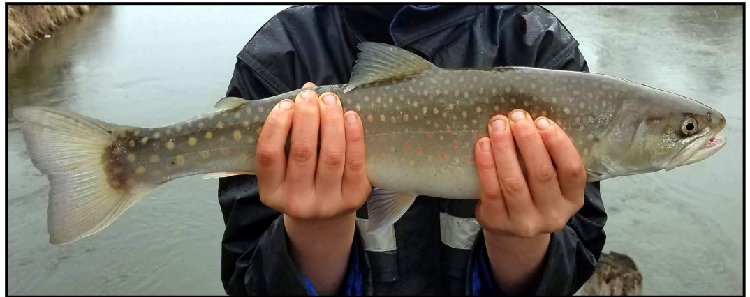
Bull trout ( Salvelinus confluentus )

It has been a long, cold and snowy winter. Now that spring has finally arrived, the urge to go outside and connect with the land is strong. One amazing way to do this is to take a hike along your favorite stream and cast a line, with the hope of catching a fish.