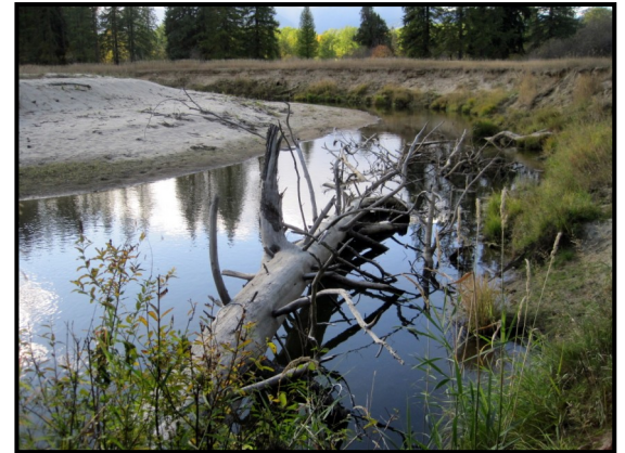
Lower Grouse Creek with unstable banks and lacking mature riparian vegetation

The Restoration Prioritization Plan Update provides an important foundation to develop future projects to help restore the natural channel form and function as well as improve aquatic habitat for native fish in Grouse Creek.