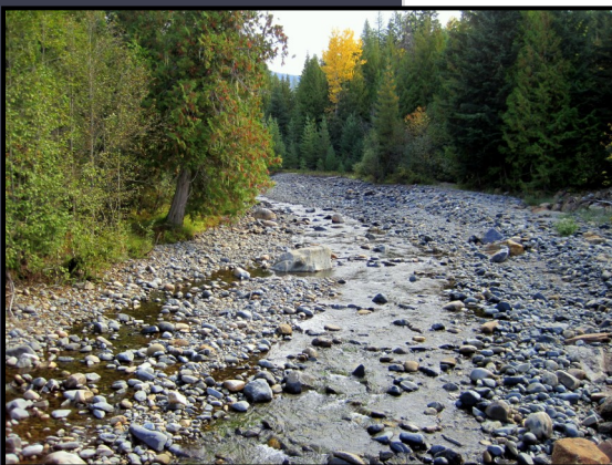
Upper Grouse Creek, lacking large woody debris

shed Assessment and Restoration Prioitization Plan (2009) identified key restoration projects and prioritized them. Several of these restoration projects have since been completed.